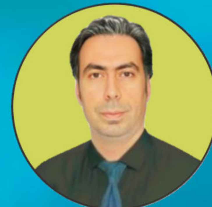
Habibollah Dadgar Iran