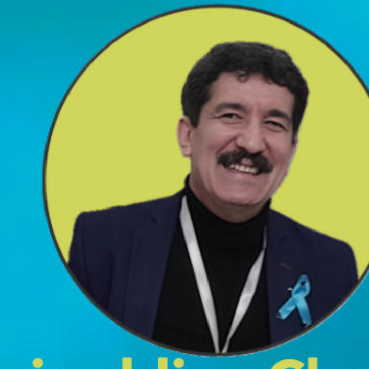
Kheireddine Chettibi Algeria